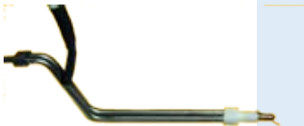
79 series probe holders